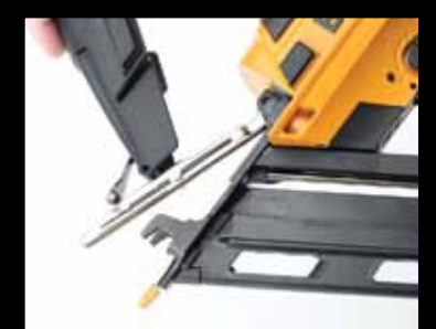
Tool-free jam release