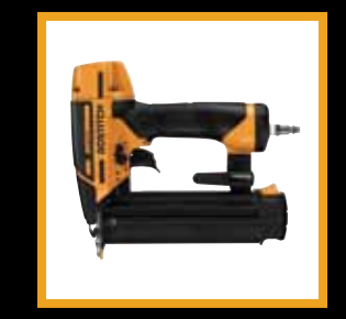
18 GA Features and Benefits http://player.theplatform.com/p/ rDn80C/KEwV0h_S_HFY/select/ I4KgMhAn05gr