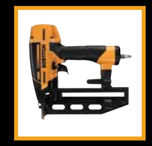
16 GA Features and Benefits http://player.theplatform.com/p/ rDn80C/KEwV0h_S_HFY/select/ FsVYWpS8BwjR