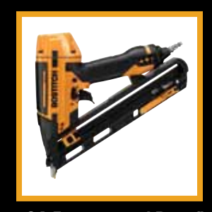
15 GA Features and Benefits http://player.theplatform.com/p/ rDn80C/KEwV0h_S_HFY/select/ l9tKA5Lvxm6J