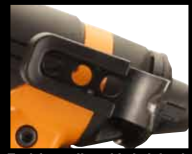
Tool-free adjustable belt hook