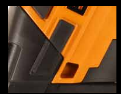
Front & side bumpers