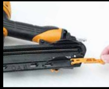
15 GA Nailers Only: air blower and 16" on-center gauge