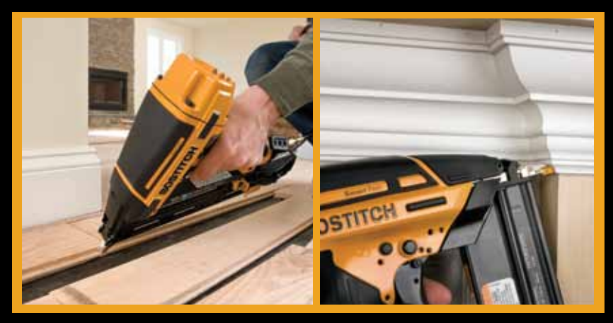
Easy to see where nail is driven