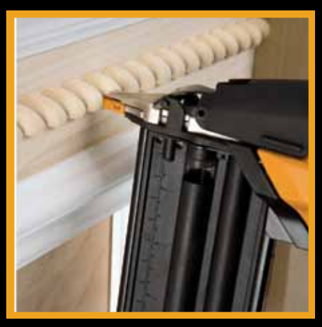
No need to push against work to actuate tool