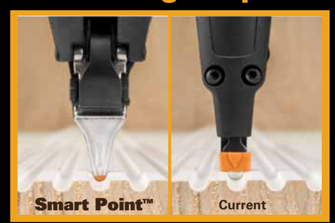
80% smaller nose than current BOSTITCH nailers