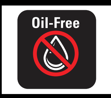
Oil-free operation requires no oil be added to the nailer