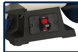
Safety ON/OFF Switch