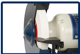
Course 60 Grit Wheel with Tool Rest