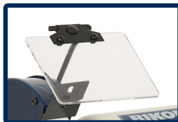
Dual Eye Shields for Safety