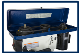
Twelve Available Spindle Speeds