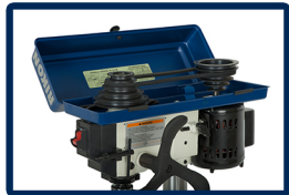
Five Available Spindle Speeds