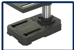
Sturdy Cast Iron Base