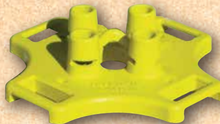
Made in China