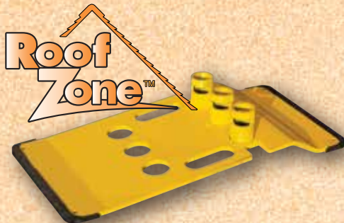
Made in U.S.A.