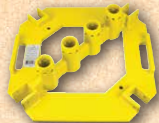
Made in China

Roof Zone Guardrail Bases are Priced Significantly Below Chinese Imports