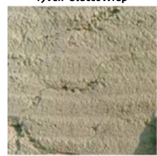
Stucco Mix 1 Tyvek® StuccoWrap®

Tyvek® StuccoWrap® has a water hold out of 210 cm when measured by the hydrostatic head test (AATCC-127) while Grade D building paper absorbs water. All this adds up to more durable and energy efficient stucco coated buildings.