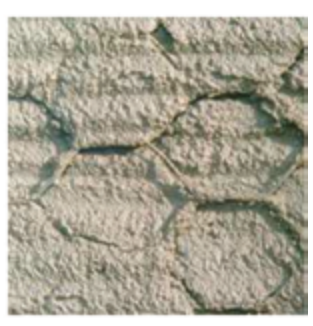
Stucco Mix #1 is "Dirty Sand", Stucco Mix #2 is "Clean Sand" Scratch coat cracking as a function of intervening layer