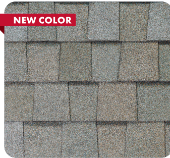
Moonlight Beach - Cool Color SRI: 18*