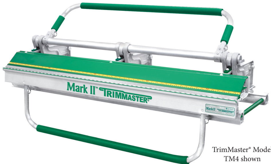
TrimMaster® Model TM4 shown

TrimCutter™ speeds up your work process saving both time & money! (sold separately)