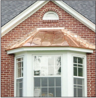
Copper Bay Windows