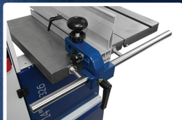
Quick-Adjust 6" Tall Rip Fence System