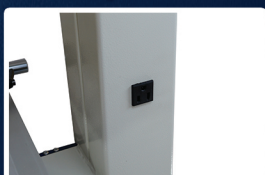
Rear 115 Volt Power Outlet