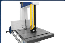
Visual Cutting Depth Scale