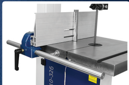
Large Work Table & 6" Tall Rip Fence