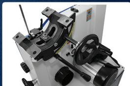
Quick-Lock Trunnion System