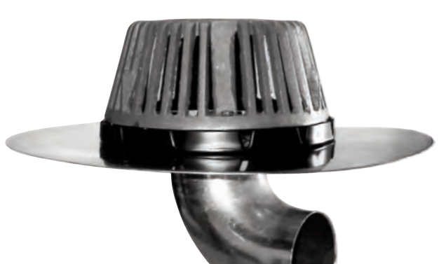
ABOVE: 4<sup>II</sup> Century Outlet Drain with clamping ring & cast iron dome